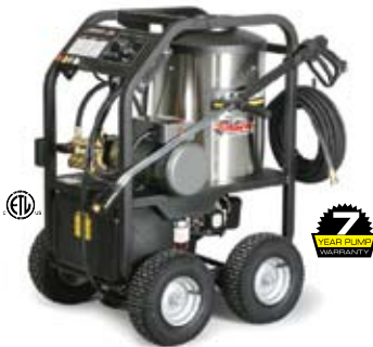
Roll cage design: Electric-powered, diesel/oil-heated

B uilt on a rugged 1 1/4" powder coated steel frame, these compact electric roll cage models are designed for construction sites, farms and factories where electricity is available. The three models deliver hot water cleaning of up to 2000 PSI using 120V or 230V/1ph. Each features a Kärcher direct-drive crankcase-style pump with 7-year warranty, industrial-grade Baldor motor and 1/2" Schedule 80 heating coil with stainless steel wrap. All are certified to UL and CSA standards.