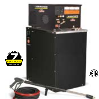
Cabinet design: All-electric hot water

This Shark Series all-electric hot water pressure washer introduces hot-water tank technology to deliver hot water on demand ideal for indoor cleaning. Water is heated by flowing through a coil inside an 80-gallon water tank. Nine 4500W heating elements generate 138,000 BTU to produce hot water of up to 180°F. Both models are ETL certified.