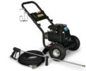
Xpert-HD 2.3/23 P Dimensions: 23"L x 22"W x 25"H

Kärcher's Xpert series is available for purchase in pallets. Choose from a pallet of a single model, or choose one of our mixed pallet options. Price per unit is as low as $630 List Price!