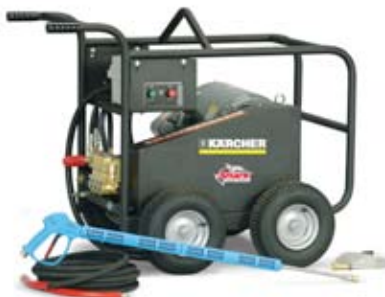
Roll-cage design: Electric-powered, belt-drive

These new Shark Series roll cage models feature cleaning power of 5000 PSI and are available with either 230/3 phase or 460/3 phase. These units are specialty machines perfect for use in the marine market cleaning the bottom of boats or in the concrete industry for cleaning trucks, forms and handling equipment. Hoses, wands, guns and fittings are high-pressure rated and both models are ETL safety certified.