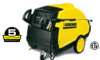
Classic design: Portable all-electric hot water

This Classic Series unit is an electric powered machine that provides electrically-generated heat for those special applications where hot water is required but where gas or oil-fired ignition is prohibited. The 801E is optimal for use in hospitals, food factories, and other areas where indoor emissions present a concern. Models are ETL certified to UL & CSA safety standards.