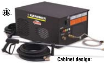
Cabinet design: Electric-powered, belt-drive