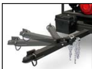
Swing-away hinge makes for easy storing and shipping