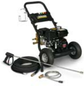
Xpert-HD 2.5/27 P Dimensions: 23"L x 22"W x 25"H

**Crankcase pumps come with 7-year warranty.