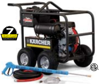
Double-axle, cage design: Gasoline- or diesel-powered, belt-drive