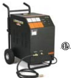
Portable heating module: Diesel/oil-heated

FOR ATTACHING TO A COLD WATER PRESSURE WASHER