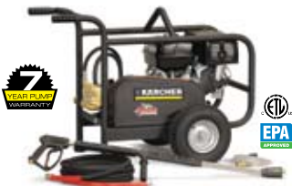
Single-axle, cage design: Gasoline-powered, belt-drive

These Shark Series roll cage models are the most powerful units in our cold water line, with cleaning power of up to 5000 PSI. Protected by a rugged powder coated roll cage built of 1¼" steel, the PB Cage units feature powerful Vanguard, Honda or Kohler engines, tri-plunger oil bath Kärcher pumps, 13-inch tubed pneumatic tires, and an extra rugged belt-drive assembly with notched V belts and cast iron pulleys. All single- and double-axle models are ETL safety certified.