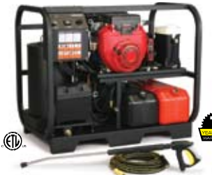
HDS Pe cage models