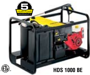
HDS 1000 BE