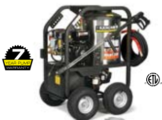
HDS 2.5 and 2.8 compact: Gas-powered, diesel/oil-heated