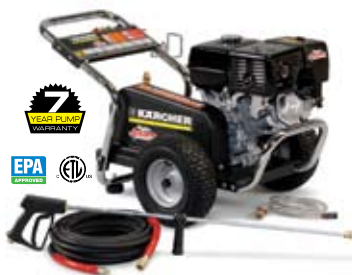
Cart design: Gasoline-powered, belt-drive

Note: Hose not included with hose reel kit