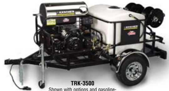
TRK-3500 Shown with options and gasoline-powered hot water pressure washer; accommodates gasoline-powered pressure washers only

K ärcher has made customizing a mobile wash system for on-site cleaning as easy as 1-2-3: • Step 1: Choose from two rugged trailers—the dual-axle TRK-6000 with 330-gallon water tank or the single-axle TRK-3500 with 200-gallon water tank.