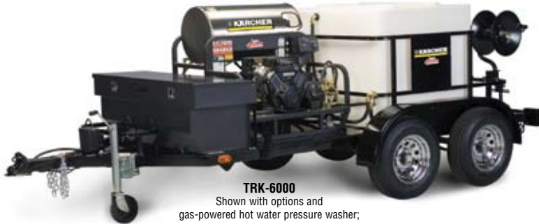
TRK-6000 Shown with options and gas-powered hot water pressure washer; accommodates both gasoline- and diesel-powered pressure washers