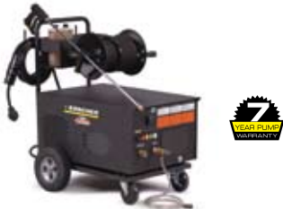
Wheel Kit with detergent rack and optional hose reel