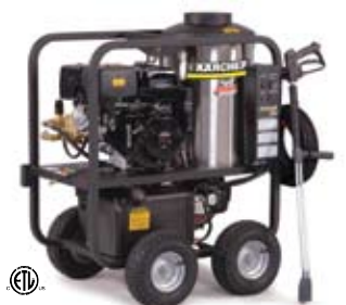
HDS 2.6 and 3.5 full-size: Gas-powered, diesel/oil-heated

These portable gas-powered hot water units are built using heavy-duty components and rugged steel chassis to withstand the most rigorous conditions. Their compact frame design and tubed pneumatic wheels provide easy maneuvering in all terrains. Each unit is ETL certified and comes with a leak free Schedule 80 heating coil surrounded by a standard stainless steel wrap.