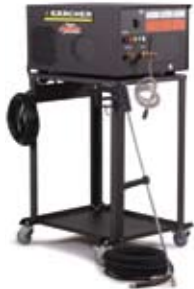
Floor stand with caster wheels

Our cold-water cabinet units really take the heat, accepting heated water up to 180°F. Protected in durable steel cabinets, they demonstrate industrial strength throughout, including belt-drive Kärcher crankcase pumps, industrial Baldor motors, and magnetic starters for operator safety. All models are ETL certified to UL and CSA safety standards.