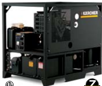
HDS high-volume skid

These durable, skid-mounted models are designed for optimum cleaning performance at remote locations and feature Kärcher's unique 12V DC downdraft burner system. The highly compact burner is more than 92% efficient, resulting in better heat transfer using much less fuel. They feature direct-drive axial pumps or belt-drive crankcase-style pumps. Certified to UL and CSA safety standards.