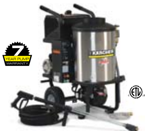
1.5 HP model: Electric-powered, diesel/oil-heated

K ärcher offers 9 North American models with their unique hand truck design, all-metal frame, heavy-duty vertical heating coil with stainless steel wrap, water-resistant control box and tubed pneumatic tires. Units come with direct-drive or belt-drive Kärcher crankcase pumps. All are ETL certified to UL and CSA safety standards.