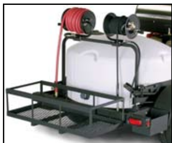
Hose reel, utility rack and saddle box options available