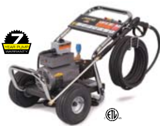
Cart design: Electric-powered, direct-drive

Our electric-powered Shark machines are durable direct-drive units that can deliver cleaning volume of up to 3.5 GPM. Powered by heavy duty industrial-grade Baldor motors, these compact electric units feature tri-plunger oil bath Kärcher pumps, powder coated steel chassis, hose racks, detergent injection, insulated guns and wands, and tubed pneumatic tires. All models are ETL certified to UL and CSA safety standards.