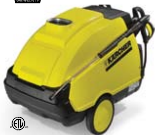
Full-size models: Electric-powered, diesel/oil-heated

Kärcher's German-built electric hot water machines are the most advanced on the market, featuring Kärcher's patented axial pump integrated with a 4-pole water-cooled motor for optimum efficiency. Kärcher's efficient and compact downdraft-fired burner uses far less fuel than standard coils. Units come standard with anti-scale system, low-fuel shut-off, low-water protection, high-temperature shut-off, thermal overload protection, pivoting spray lance, soft-grip gun, 50' hose, and high-impact Power Nozzle. Also unique to Kärcher are variable water flow, pressure, temperature, and detergent metering. All units are ETL certified to UL and CSA standards.