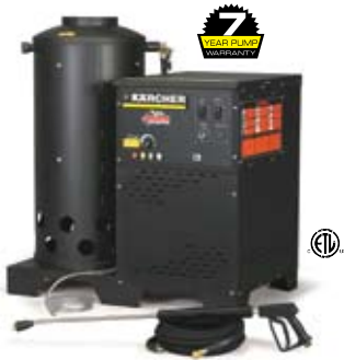
Cabinet design: Electric-powered, natural gas/LP-heated

For indoor cleaning with hot water, our Shark Series natural gas and propane gas models are ideal. They pack cleaning power of up to 3000 PSI and yet fit within a small footprint. Powered by electricity and heated by natural gas or liquid propane, all 10 models are driven by industrial belt-drive high-pressure Kärcher crank-style pumps and feature Schedule 80 heating coils. All units come with North American fittings and accessories and are ETL certified to UL and CSA safety standards.