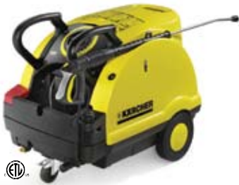
Compact "C" models: Electric-powered, diesel/oil-heated