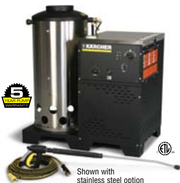
Shown with stainless steel option

Cabinet design: Electric-powered, natural gas/LP-heated