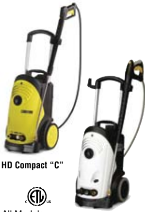
HD Compact "C"