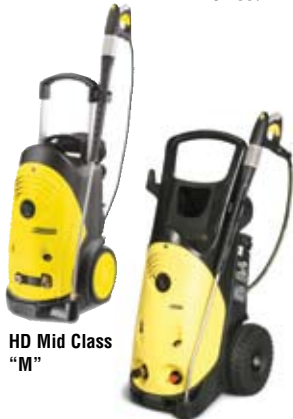
HD Mid Class "M"